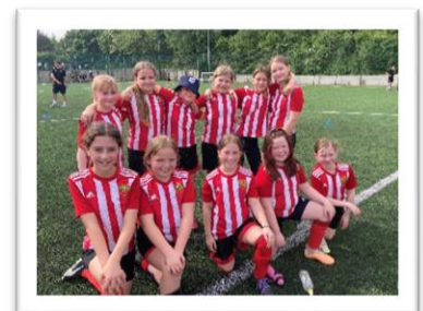
Some of our girls at the Football Skills workshop at Retford Oaks Academy on Friday 10 th May 2024.

Stay up to date with what your child is doing by regularly visiting their year group page on the school's website. These can be found here: https://www.ordsallprimary.com/all-about-our-classes/