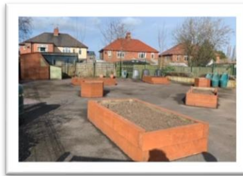
An 'after' photo of the garden.