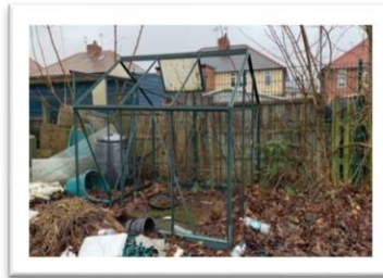
A 'before' photo of the garden.

Their groundwork team have done an excellent job of rebuilding broken raised beds, repairing the dilapidated shed and installing some new benches.