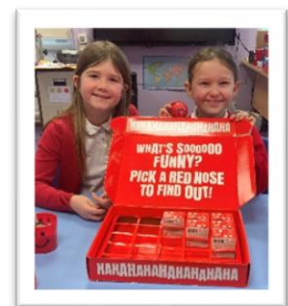
Red noses 'flew off the shelf'.

https://www.ordsallprimary.com/all-about-our-classes/