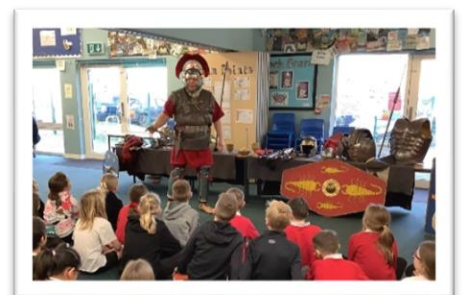
A Roman soldier visits Year 4.

https://www.ordsallprimary.com/all-about-our-classes/